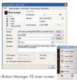
The Button Manager V2 main screen

Button Manager V2 makes it easy for you to scan and send your image to your favorite destinations with a press one button. Now the new version comes with an innovative feature to let you scan and automatically upload the scanned document to popular cloud repositories such as Google Docs, Microsoft SharePoint, or FTP. In addition, the iScan feature allows you to insert the scanned image or recognized text after optional OCR (Optical Character Recognition) process to your text editor such as Microsoft Word to get your job done easily and quickly.