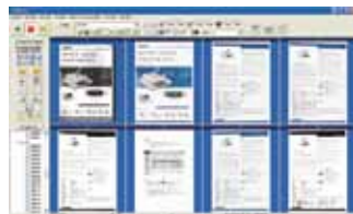
The AvScan 5.0 main screen

-The Intelligent Document Management Tool