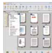
The PaperPort SE14 main screen

- The Professional Choice to Organize and Share Your Documents